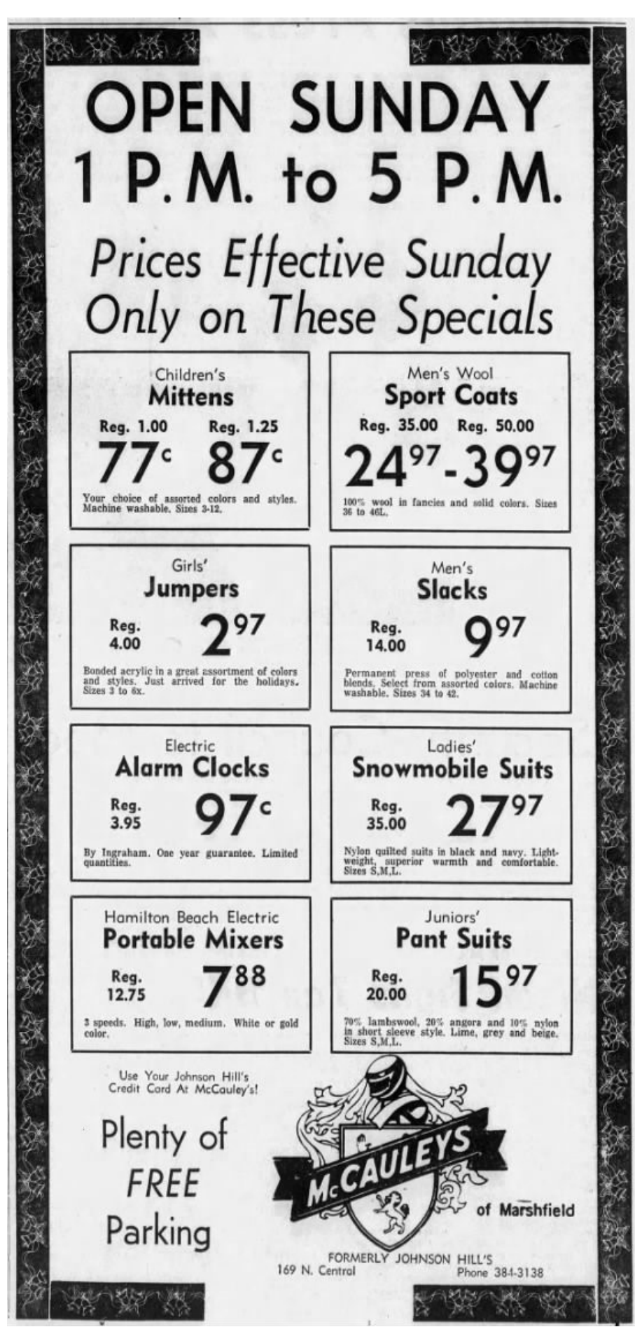
Marshfield News-Herald, Marshfield, Wisconsin, 11 Dec 1971, Sat urday, Page 2

"We know of no future plans for the use of the building at this time," he said. The five-floor store, including four stories and the basement, is the city's largest